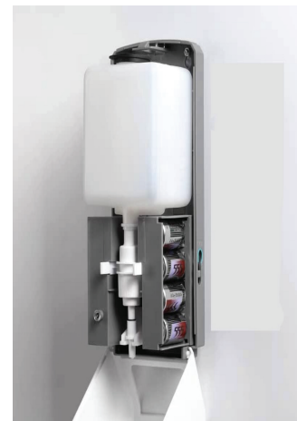
AUTOMATIC SENSOR/TOUCH – FREE DISPENSER 4 – C BATTERIES NOT INCLUDED

COST-$30.00 PER DISPENSER (BATTERIES NOT INCLUDED)