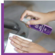
AT HOME CARE