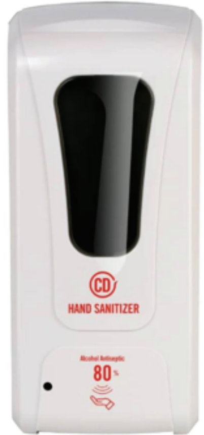
AUTOMATIC SENSOR/TOUCH – FREE DISPENSER EACH REFILLABLE BOTTLE = 1,000 ML EACH SPRAY USE = 1ML COST PER SPRAY USE LESS THAN 1CENT