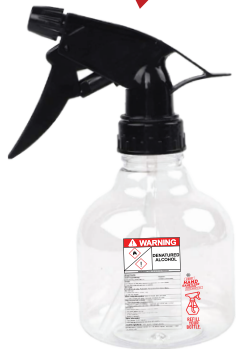
WARNING & DRUG FACTS LABEL USE ON SPRAY BOTTLES (SPRAY BOTTLE NOT INCLUDED)