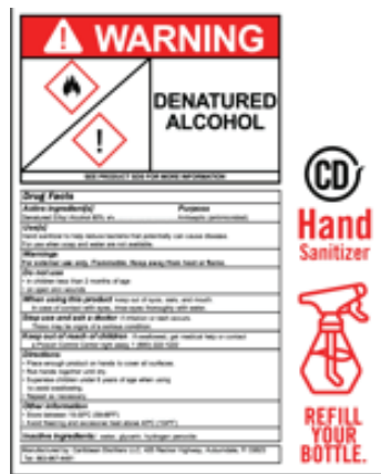
WARNING & DRUG FACTS LABEL

2 WARNING & DRUG FACTS STICKERS INSIDE BOX, EMPLOYEE SHOULD PUT THE STICKER ON YOUR PREFERRED SPRAY BOTTLES (SPRAY BOTTLES NOT INCLUDED)